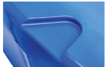
Flats for connections