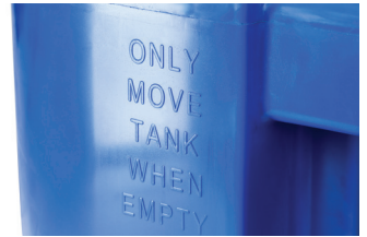
Moulded in safe handling instructions